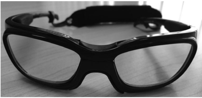
Figure 2. SHAW Lens™