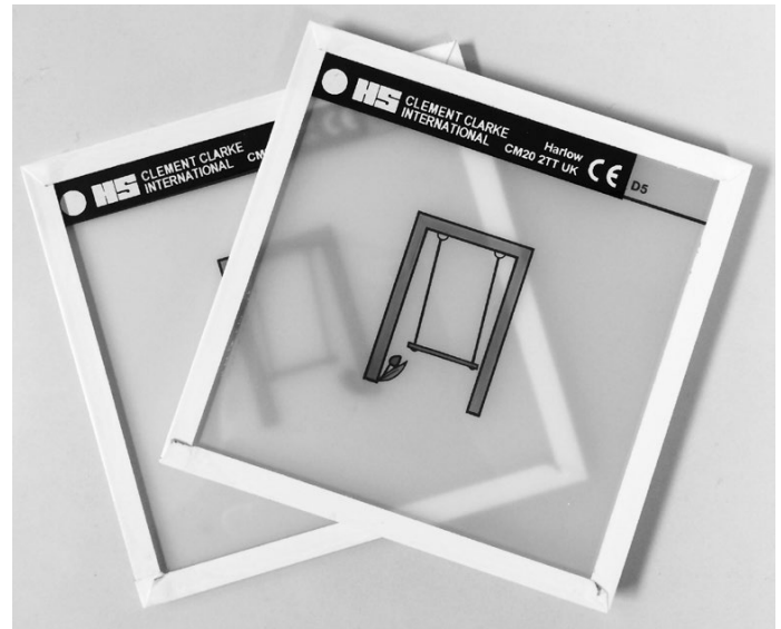
Figure 4. Flom swing

Oculomotor therapy activities began with gross saccades using the space fixator. Bilateral integration was incorporated into the oculomotor therapy with alternating hands as well as ipsilateral and contralateral movements. A metronome was added in order to integrate auditory processing, rhythm, timing, and speed with visual processing. Pursuits and saccades were done monocularly in a binocular field using the 8.5" x 11" GTVT chart. Two red-green Bernell sticks were held approximately 10" apart and about three feet away while the patient performed saccadic eye movements from one